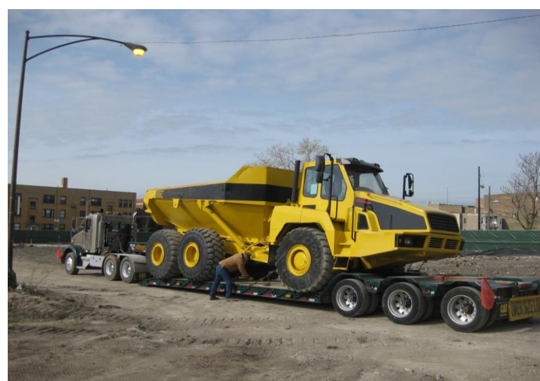
Pictured Clockwise (starting above left):