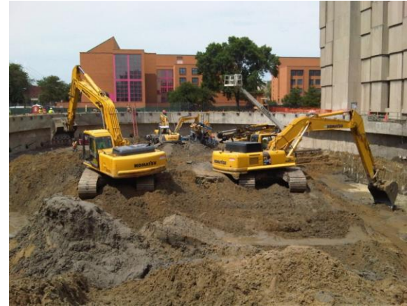
Pictured Clockwise Mansueto Library Sequencing (starting left):

(1) After completion of the slurry wall, JKC begins with first cut of primarily urban fill and sand, (2) Upon completion of sandy materials, JKC begins double handle of thick clay materials (3 & 4) JKC continues double handling of clay materials to perimeter and loading out with PC400 long front (5) base slab / mud mat is poured and JKC demobilizes.